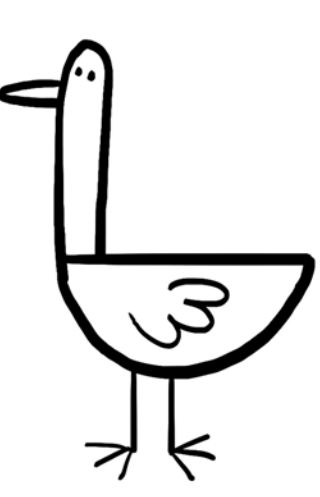
5. And two stick legs. Make three toes on the end of each leg.